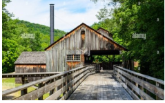
PA Lumber Museum

New Location at the edge of the Allegheny National Forest