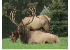
Elk viewing in Benezette

814-726-3000 Mention RETREADS for special room rates